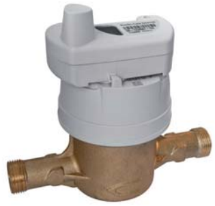
EverBlu Cyble Enhanced fitted on Residential water meter

The EverBlu Cyble Enhanced is suited to various applications for residential, commercial and industrial uses.