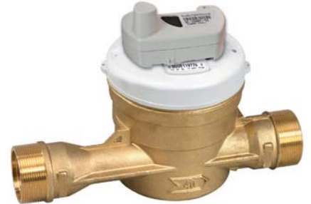
EverBlu Cyble Enhanced fitted on Commercial and Industrial water meter