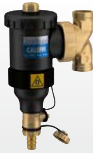
PCT INTERNATIONAL APPLICATION PENDING